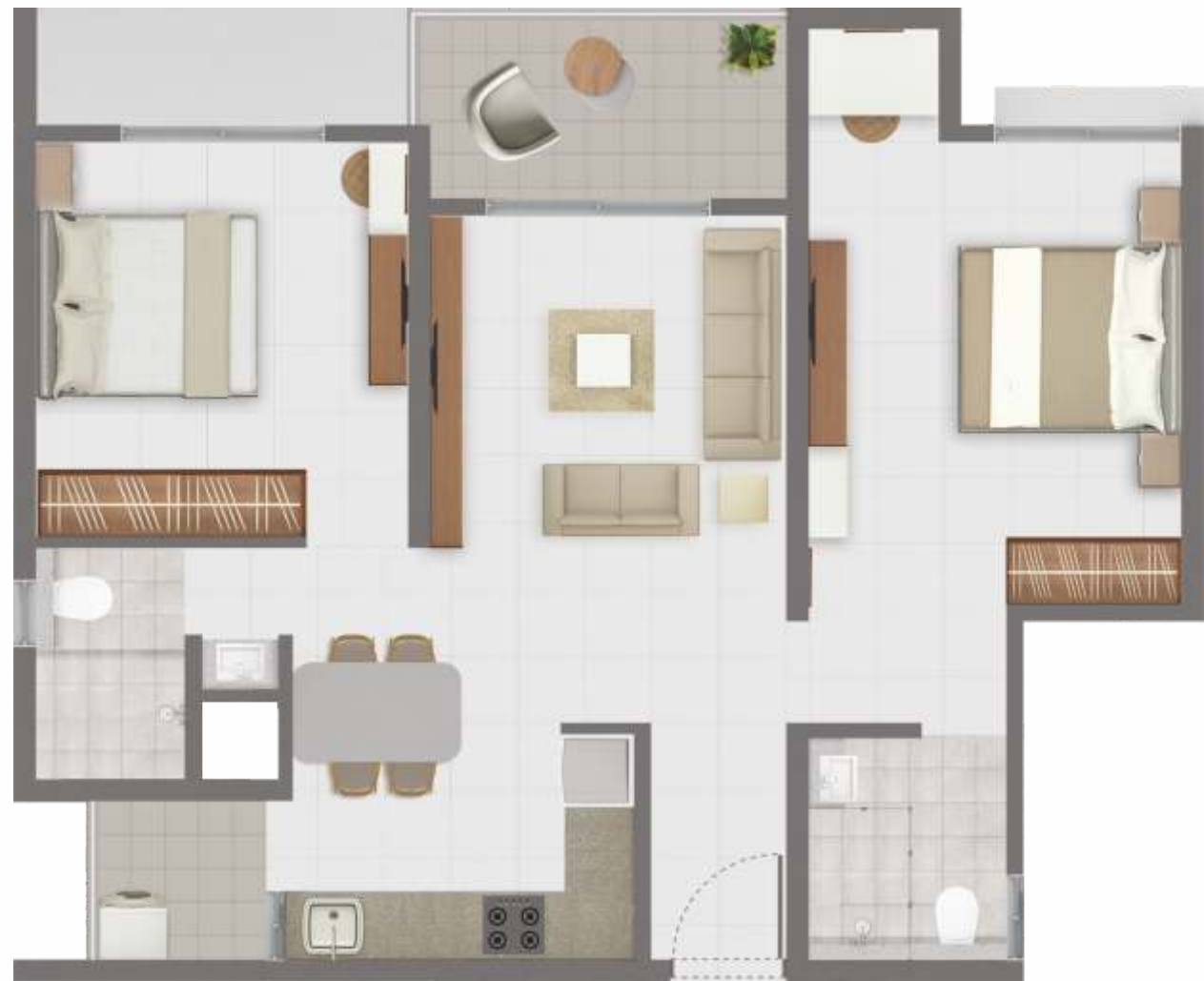
2 BHK Type 3