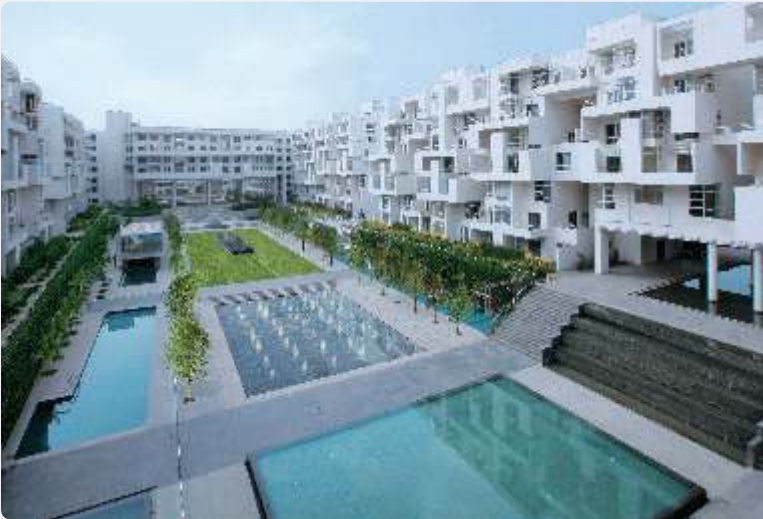
Rohan Mithila, Opp. Airport, Pune.

Our work makes us proud, with 11 million+ square-feet of living spaces and 10000+ happy families, our best salesmen are our home owners and the most trustworthy brand ambassadors.