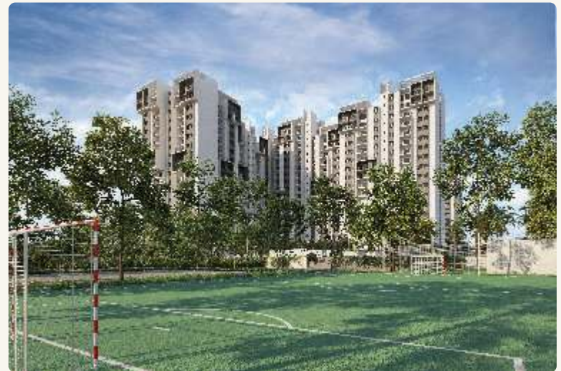
Rohan Upavan, Off Hennur Road, Bangalore.