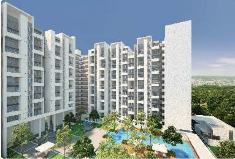
Rohan Madhuban-II, Bawdhan, Pune.