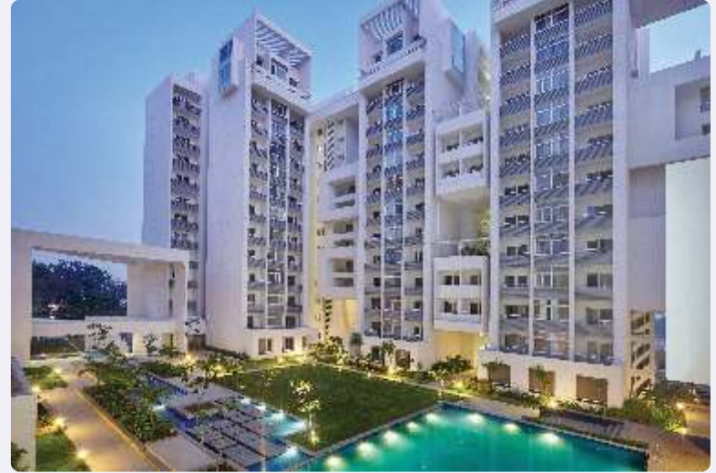
Rohan Avriti, ITPL Road, Bengaluru.