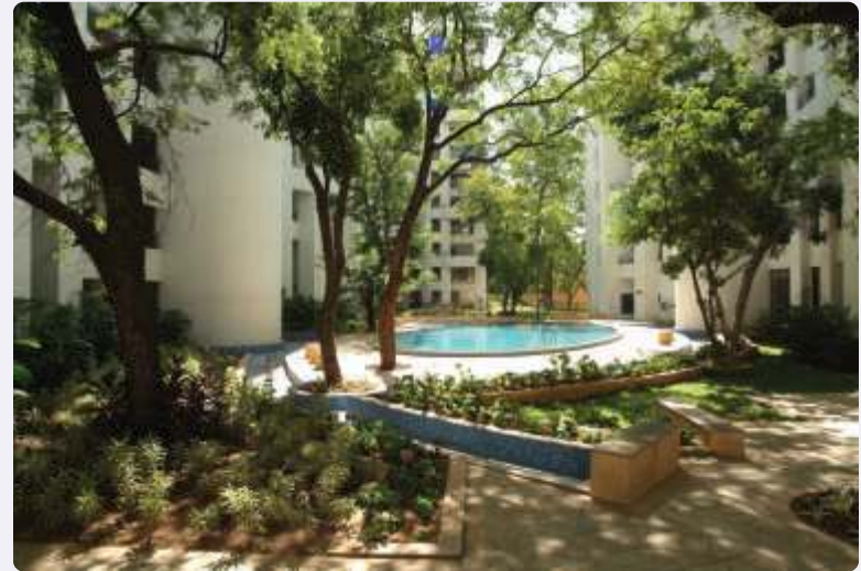
1 Modibaug, Ganeshkhind Road, Pune.