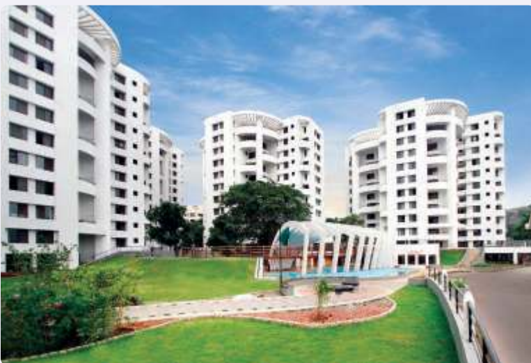
10 Kasturkunj, Bhosale Nagar, Pune.